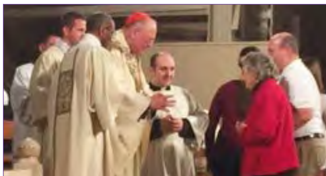
Persons with disabilities were chosen to present offertory gifts to Timothy Cardinal Dolan