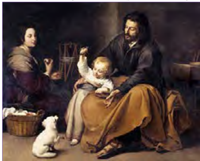
Bartolomé Esteban Murillo (1617-1682)

Christ, as a toddler, playfully holds a little bird that the white dog is intrigued by. Saint Joseph, foster father of Jesus, holds Him and watches with a smile on his face. The Virgin Mary, left, looks on while in the middle of a chore.