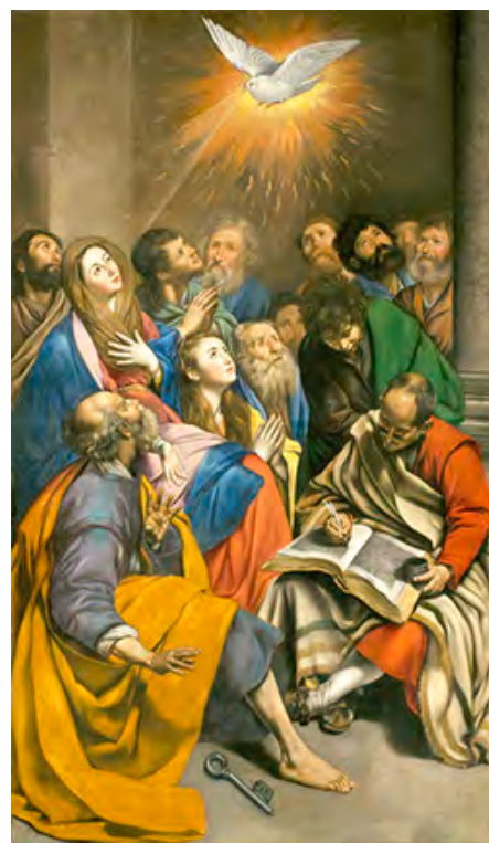
The Church's First Witnesses The Pentecost Fray Juan Bautista Maino 1581-1649

I once heard a story of a little boy who, in an outburst of anger, shouted to his mother: "I hate you! I hate you! I hate you!" Then, fearing punishment, he ran up into the hillside where he shouted into the valley: "I hate you! I hate you! I hate you!" And back from the valley came the echo: "I hate you! I hate you! I hate you!" This terrified