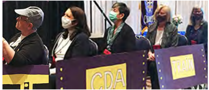
CDA members catching the train with prospective new members