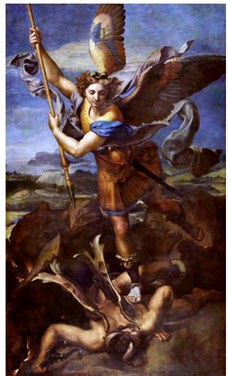
St. Michael Vanquishing Satan Raphael Sanzio da Urbino - 1483-1520

In the wilderness, Jesus faced an assault on what was deepest and best within Him, but He did not face that assault alone. He had resources to combat the spiritual assault. According to the Gospel (Lk 4:1-13), Jesus entered the wilderness "filled with the Holy Spirit." When he was at His most vulnerable, the Spirit was at work in His life. He also had the resource of the Scrip-