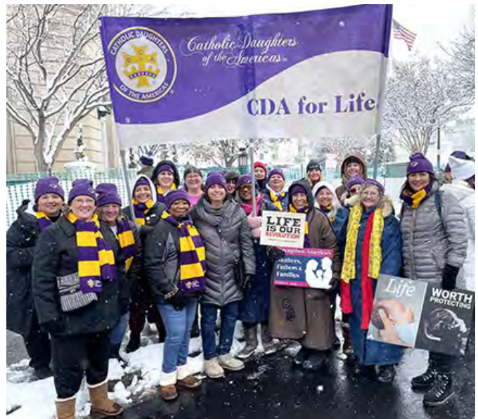
CDA Members on the Move for Life