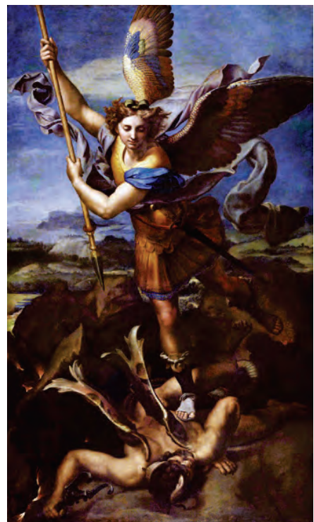
St. Michael Vanquishing Satan Raphael Sanzio da Urbino - 1483-1520

In the wilderness, Jesus faced an assault on what was deepest and best within Him, but He did not face that assault alone. He had resources to combat the spiritual assault. According to the Gospel (Lk 4:1-13), Jesus entered the wilderness "filled with the Holy Spirit." When he was at His most vulnerable, the Spirit was at work in His life. He also had the resource of the Scrip-