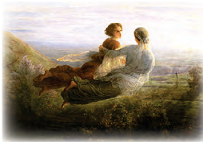
The Soul's Flight

Louis Janmot 1814-1892