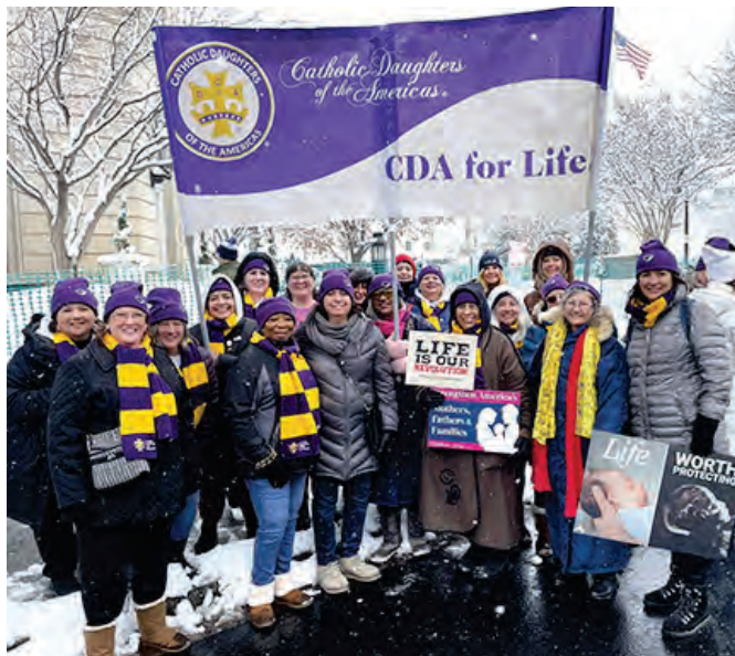
CDA Members on the Move for Life