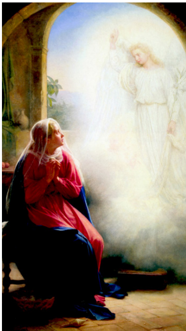
The Annunciation Carl Heinrich Bloch (1834-1890)