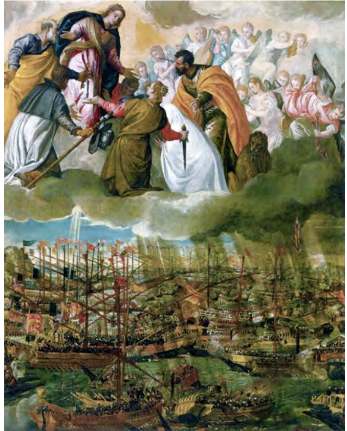
Battle of Lepanto

When Pope Pius V heard of the victory—and the defeat of the Muslim plans to invade and conquer Europe, he attributed the victory to Our Lady through the prayers of Christians throughout Europe. He established a feast in honor of Our Lady of Victory to be celebrated each