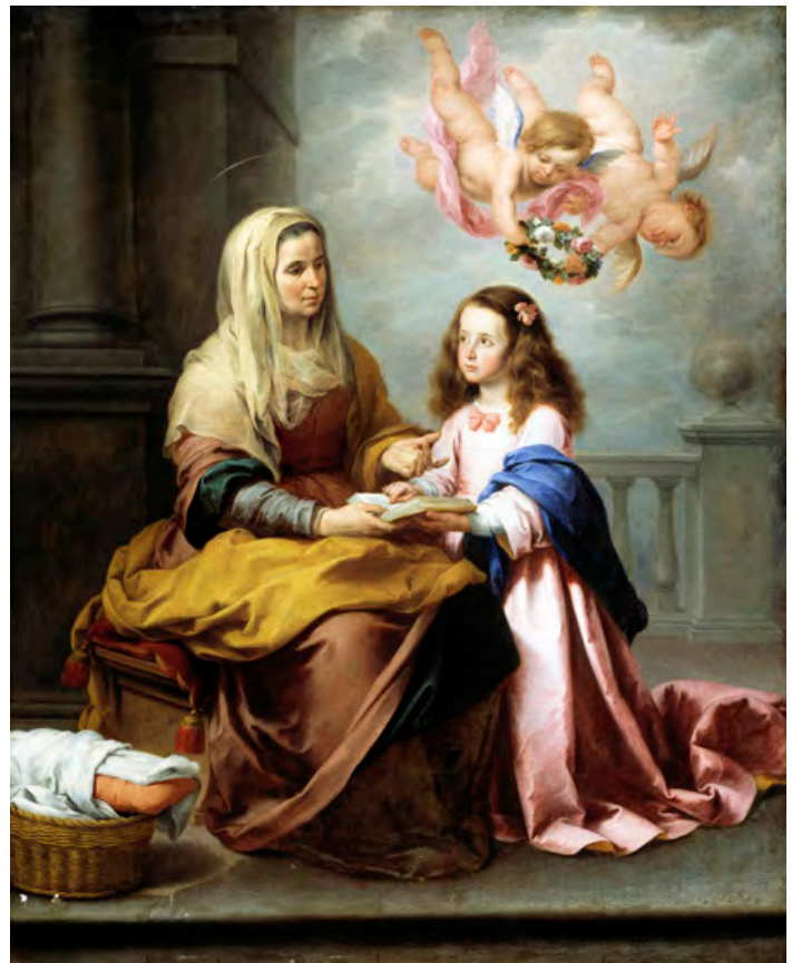
St. Ann and Our Lady