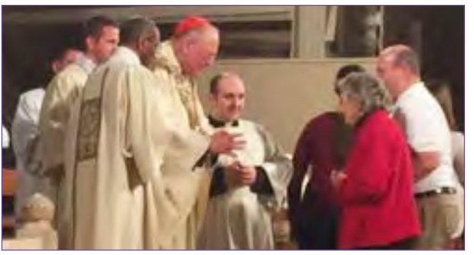
Persons with disabilities were chosen to present offertory gifts to Timothy Cardinal Dolan

aisles to participate in this very special Mass. The overflow attending watched on monitors on the lower level of the basilica. The young were respectful and joyful, but sober remembering all the babies that had been aborted. The youth were there to proclaim life.