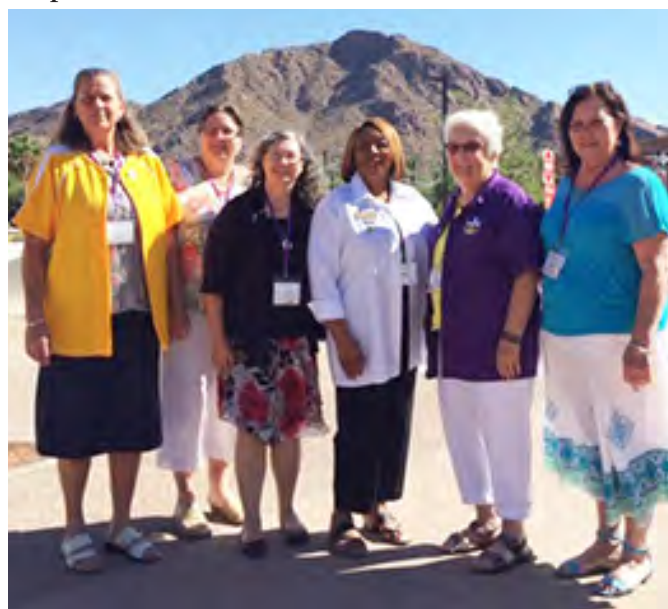
Officers with Camelback Mountain in background

Information and forms for all our Circle of Love forms will be in the September Quarterly and will be on the National website: www.catholic-daughters.org . Check out this site and Pennsylvania's website: www.cdapa.com . ♦