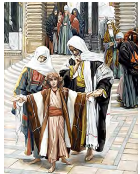
Jesus Found in the Temple James Tissot (1836-1902)

May we all, as God's beloved children, through the intercession of the Blessed Virgin Mary, in "Unity and Charity," remain inspired by the beautiful growth and changes we see around us and seek to become the people our good and gracious God intends us to be. ♦