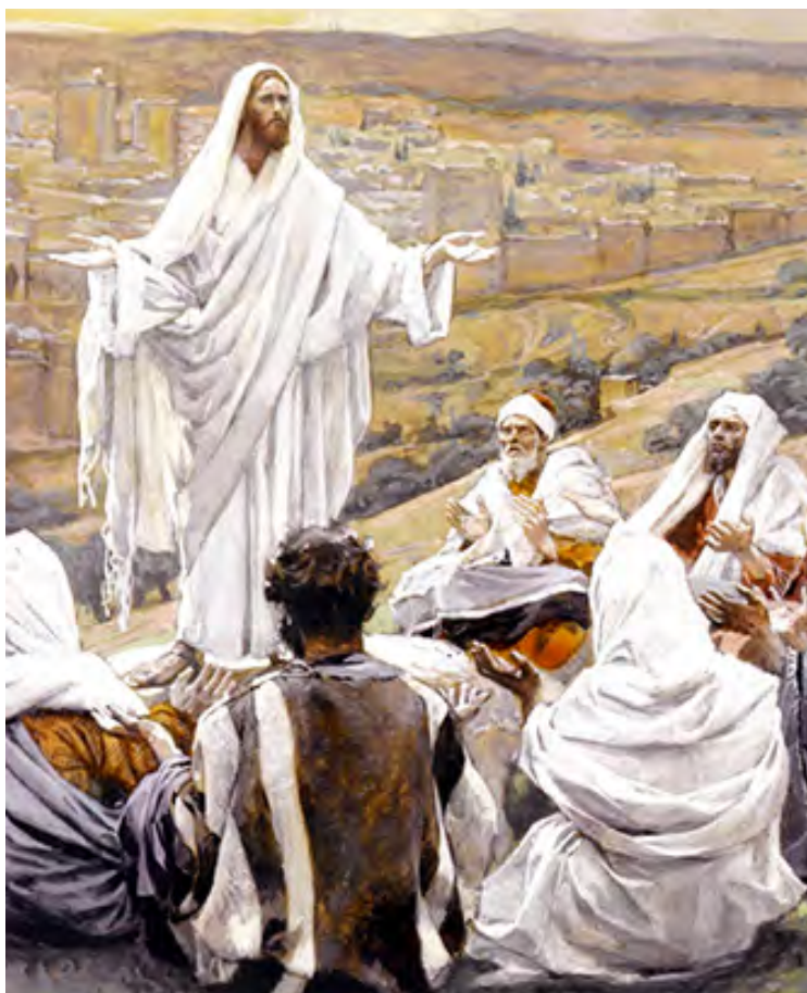
The Lord's Prayer

Gathered around Jesus, the disciples ask him to teach them to pray. With arms opened wide and hands upraised in a gesture of humility, Jesus begins his prayer with an acknowledgment of God's power in heaven and on earth. —Brooklyn Museum