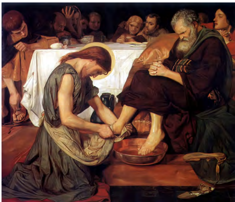
Jesus Washing Peter's Feet

Ford Madox Brown (1821-1893), RestoredTraditions.com