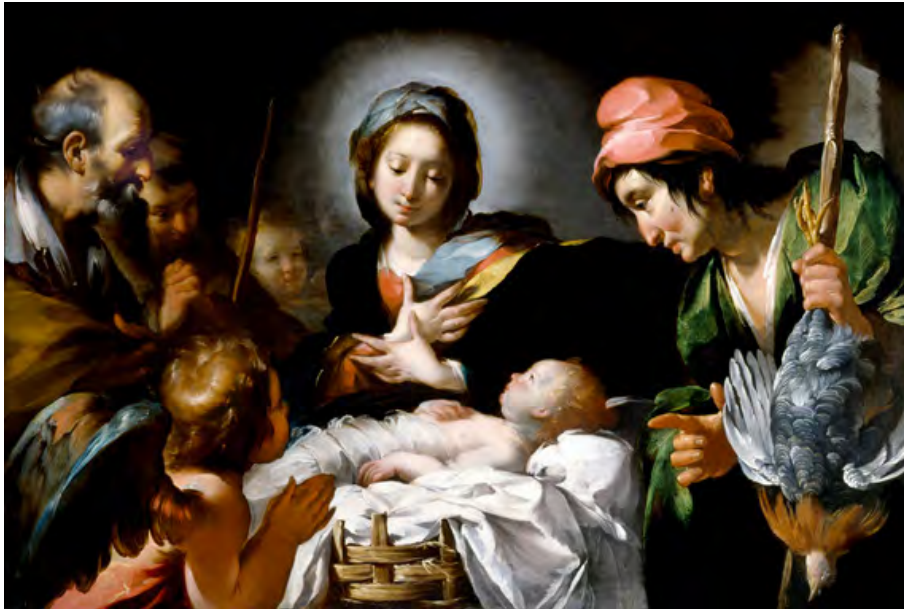
Adoration of the Shepherds, Bernardo Strozzi, ca. 1615

Soon, we will be saying to one another, Merry Christmas and Happy New Year . However, these should not be just words though, for Christmas should not be just a one-day celebration of the birth of Jesus. The birth of Jesus is something