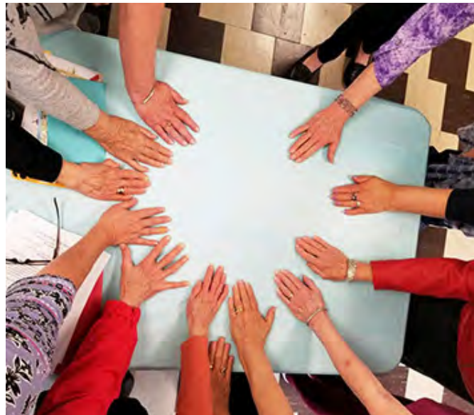
Hands of all members in attendance at May meeting.

C ourt Of Our Lady #647 celebrated its 100th Anniversary at a Mass at St. John Gaulbert Cathedral on May 23, 2021. A delightful luncheon for members and spouses followed.