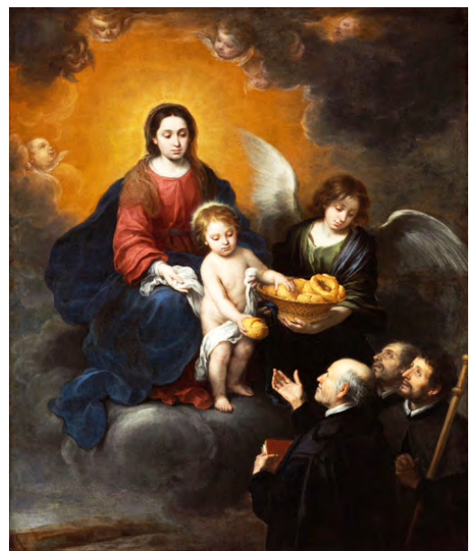
Infant Jesus Distributing Bread