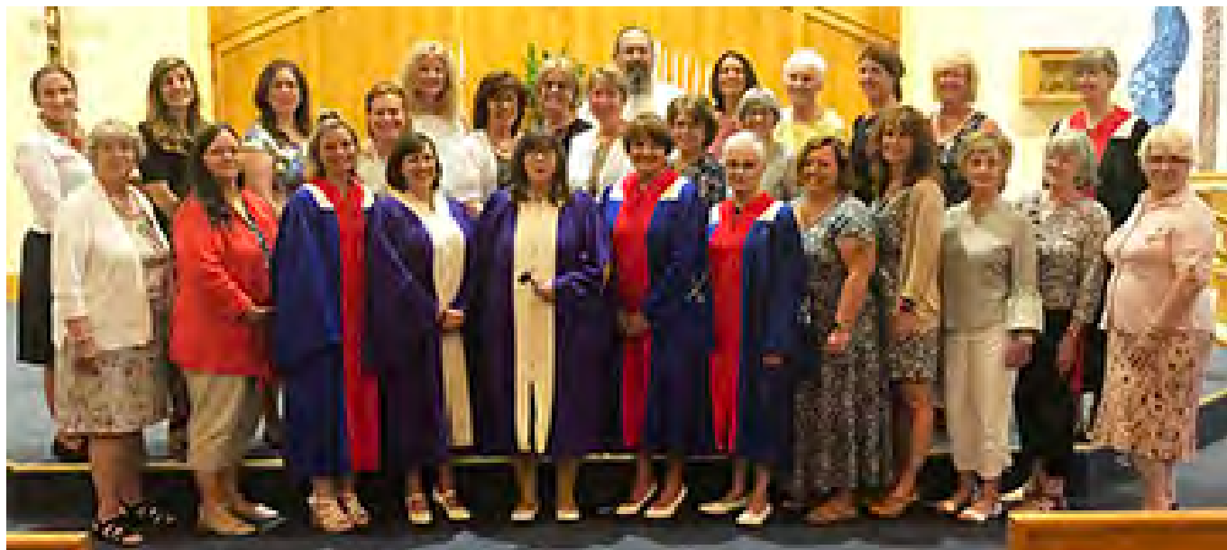
Newly-installed officers and members, Court St. Gianna Molla #2764