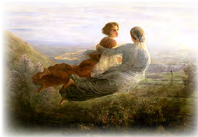
The Soul's Flight

Louis Janmot 1814-1892