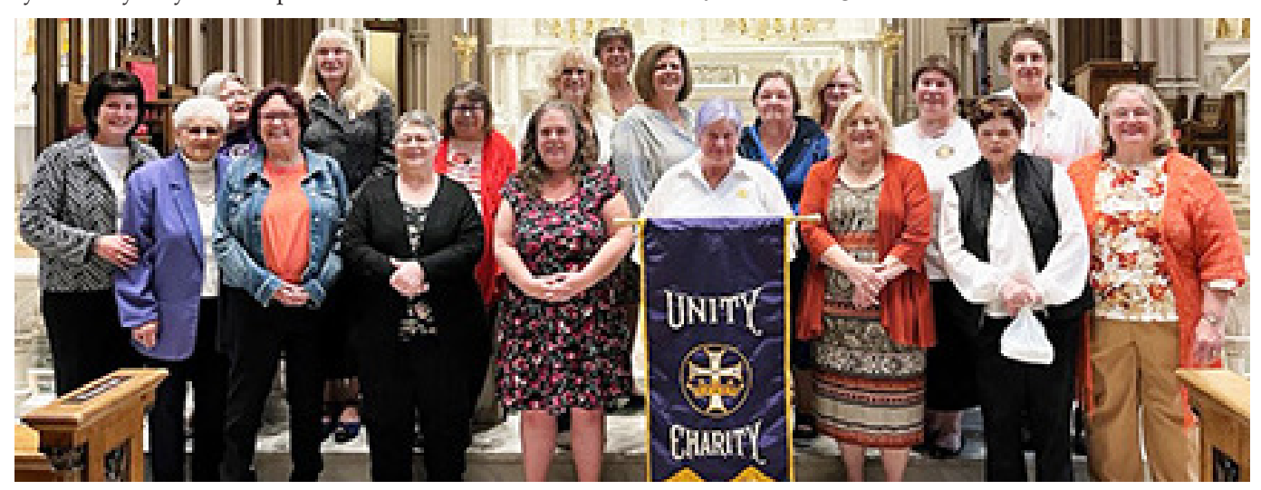
Our ladies before the altar of St. Paul Cathedral

who is currently a seminarian in the Pittsburgh Diocese studying and in formation at St. Vincent Seminary, Greensburg, PA.