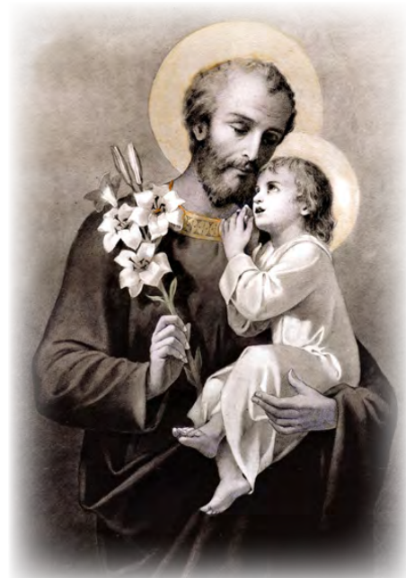
Antique Illustration of St. Joseph and Child Jesus