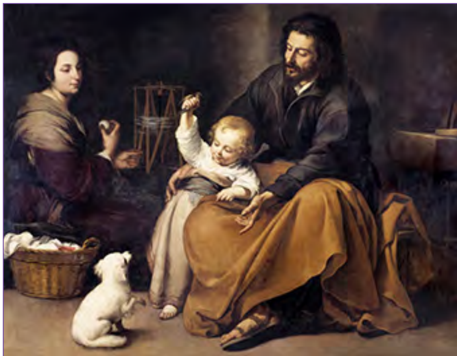
Bartolomé Esteban Murillo (1617-1682)

And do thou, most glorious patriarch, St. Joseph, help us with thy powerful patronage, and place our petitions in Mary’s hands, that she may offer them to Jesus Christ. Amen.